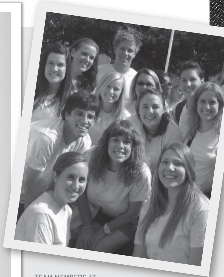
TEAM MEMBERS AT BEREAN CHRISTIAN CELEBRATE DENIM DAY!