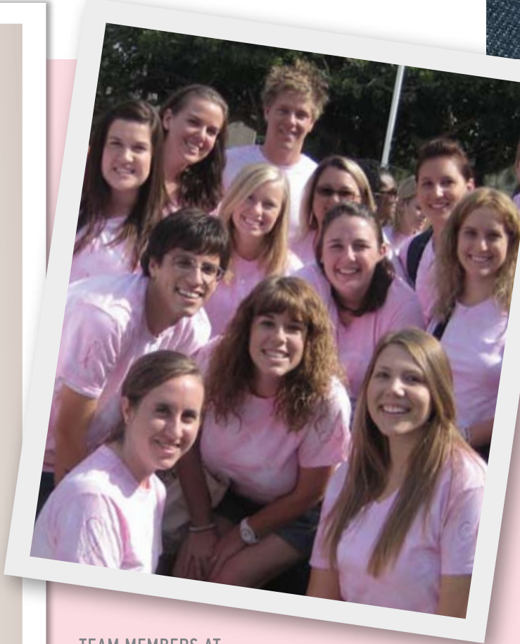
TEAM MEMBERS AT BEREAN CHRISTIAN CELEBRATE DENIM DAY!